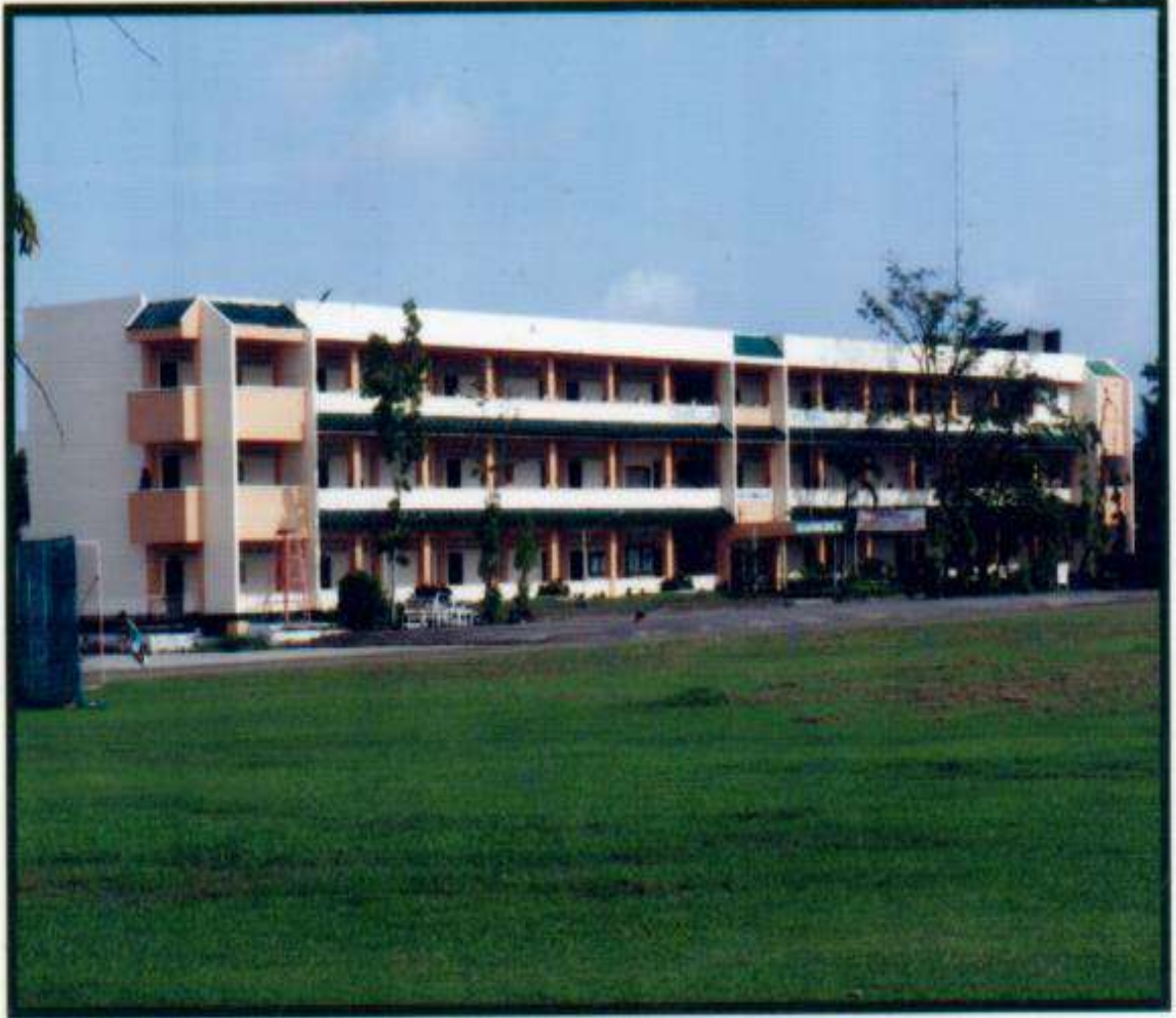
FELIX O. ALFELOR MEMORIAL HALL