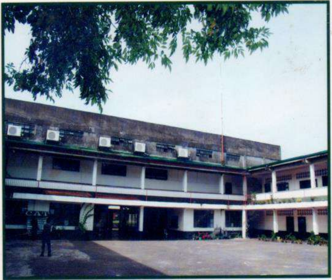
HIGH SCHOOL PALLADIUM BUILDING