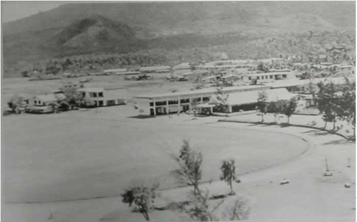
The MMC Oval now the UNEP Oval. On the background, the left side building was the Nightingale's Villa, the then nursing dormitory, now the dormitory for boarders, faculty, student assistants and varsity players. On the right side was the newly constructed U-shaped concrete high school building equipped with science and laboratory equipment, which were all destroyed by electrical fire in 1975.